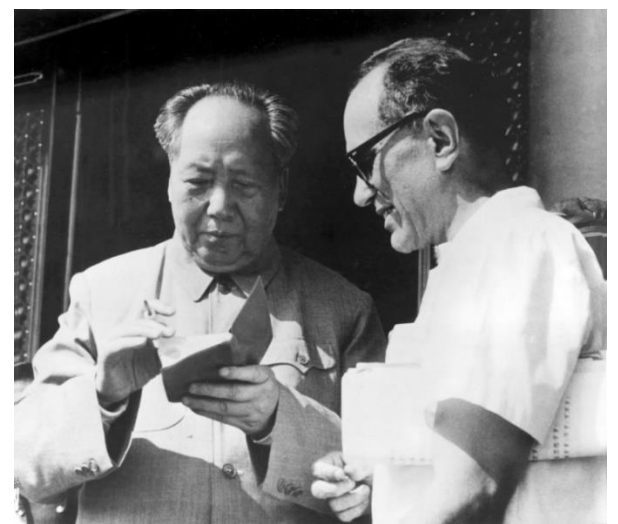
Sidney Rittenberg with Mao Zedong during a gathering of Communist Party leaders<sup>28</sup>

Among many sabotage operations, Rittenberg informed the Communists that the USA will allow Chiang Kai-Shek to wipe out Communist troops in their own zone.