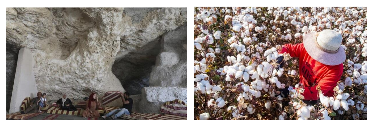
Israel issues demolition notice for Palestinian cave home <sup>126</sup>(Left). A farmer harvests cotton in a field on October 10, 2020 in Hami, Xinjiang Uygur Autonomous Region of China <sup>127</sup>(Right)

A Russo-Israeli-Kazakhstan billionaire/entrepreneur envisioned the alliance between Israel and China, with terrorism at its apologetic core as to how best to handle non-compliant rowdy Muslim populations while circumventing international law and the Geneva convention at the same time. One scenario shows how the smart city initiative will play out along the Belt and Road.<sup>125</sup> If Chinese and Palestinian precedents shed any light, this certainly presents unpleasant outcomes for excluded undesirables.