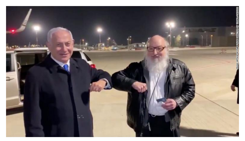
Israeli Prime Minister Benjamin Netanyahu (left) greets Pollard in Tel Aviv.

Coming back to LAKAM, it was disbanded in 1986 following Pollard's arrest for espionage on behalf of Israel [and the Soviet Union]. Pollard was paid to deliver large volumes of classified documents to LAKAM agents for which he was convicted and sentenced to life imprisonment. Secretary of Defence, Dick Cheyney, demanded a life sentence for Pollard. Pollard said he was merely spying for an ally of the United States. The materials stolen had little relevance to the Middle East but were extremely important to the interests of the Soviet Union. Despite repeated requests from Israel, especially the office of Benjamin Netanyahu, Pollard served thirty-years and is now happily back in Israel.<sup>76</sup>