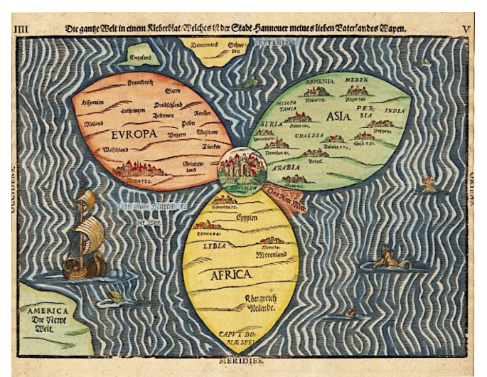
The entire World in a Cloverleaf. Jerusalem is in the centre of the map surrounded by the three continents.

But the US-China storm, rather than blow over, has only intensified. Now, as we approach the eye of the storm, countries like Israel are being forced to choose between two Great Powers. And while Israel has folded twice to US pressure in recent memory—the desalination plant and Huawei—some in Jerusalem may yet be considering Beijing's patronage preferable.<sup>118</sup>