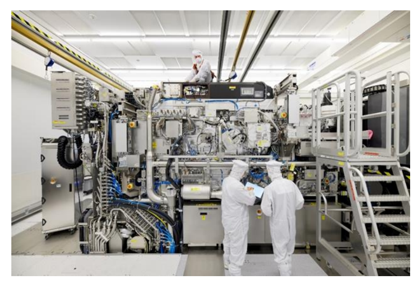
Extreme ultraviolet lithography machine. The chip-making machine at the centre of Chinese dual-use concerns<sup>151</sup>

The ASML machine uses extreme ultraviolet (EUV) light beams......That in turn makes it possible to create faster and more powerful microprocessors, memory chips and other advanced components, which are critical for consumer electronics and military applications alike.<sup>150</sup>