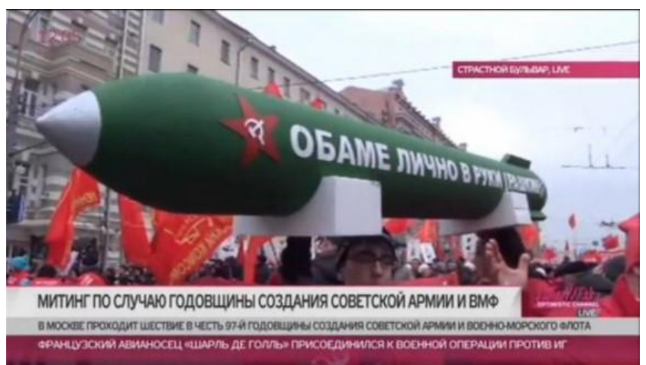
Many of the monstrous strategic missiles displayed in Red Square parades during the Soviet era were only dummies, but they scared the West into an expensive response<sup>15</sup>

The phrase "became available" is a subtle way for DOD to state that the U.S. made the technology available (as shown below). This technological transfer was concealed from the public and continues to this day.<sup>14</sup>