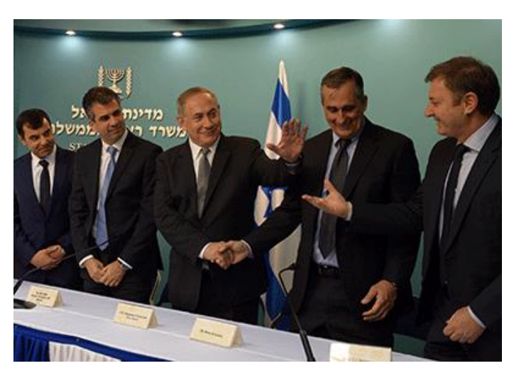
Benjamin Netanyahu congratulates Intel CEO Brian Krzanich on Intel's acquisition of Mobileye.

The AMD "Epyc" series of data centre processors thrash Intel to the point of irrelevance. They have twice the processing power (at least) and use a minimum of %30 less power on average...and often much less. This is important in GIANT data centres and server farms where your electrical bill can amount to millions a month in large centres. Also, more heat means more cooling costs and physical space. Imagine, you need to expand your data centre and you can buy AMD that are cheaper, twice as powerful, %30 cheaper to run and have 1/10th (literally) the security problems Intel have. You think that is a big decision to make?