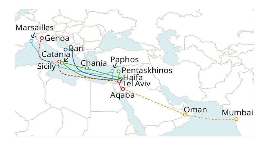
Google's fiber optic cable project

More importantly, however, is the fact that Israel has positioned itself as 'warden of the internet'<sup>121</sup> — this is where everything is remotely traded, controlled and administered. As the world's worldwide web self-appointed guardian, although a few miles off-track of China's Land and Maritime roads, Israel is ready, moment by moment, to position itself at the centre of both belts.<sup>122</sup>