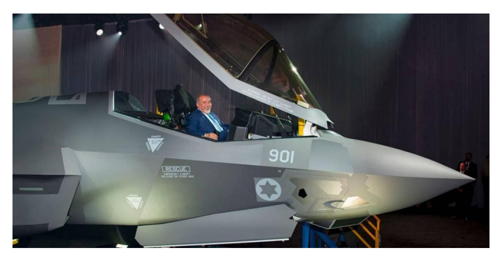
Israeli former Defence Minister Avigdor Lieberman in Israel's first F-35 during the ceremony at Fort Worth

Some might say he didn't go far enough, given the latest debacle with Russia virtually copying the F35's helmet in its SU-57 stealth fighter jet.<sup>48</sup> The F35, meanwhile, only a Trillion-dollar AI fighter jet integrated with the Pentagon's latest AI defence system hub, was recently handed over to Israel while Lieberman was still in office.